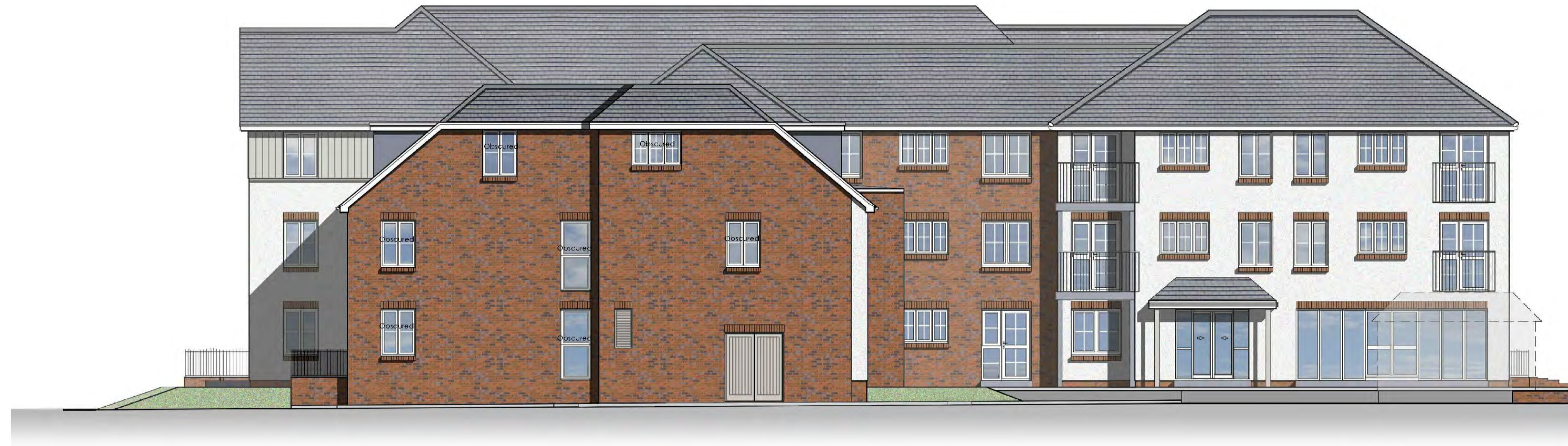
Elevation CC 1:100